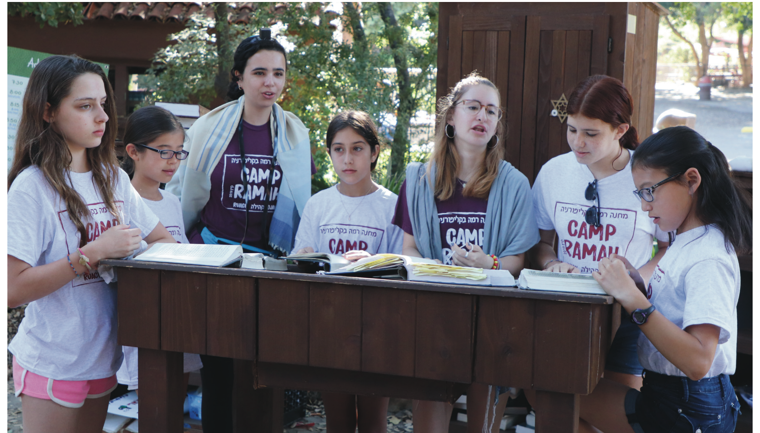
Ramah California, 2019