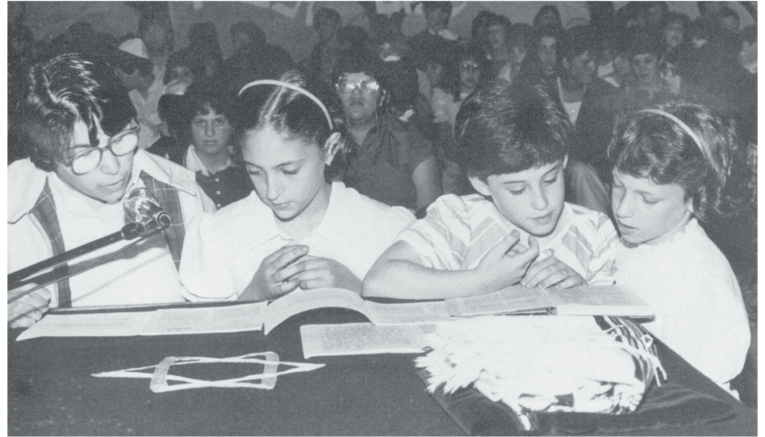
Ramah New England, 1980s