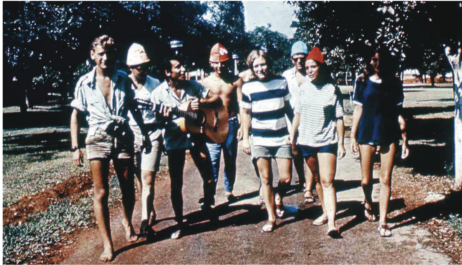
Ramah Berkshires, 1960s