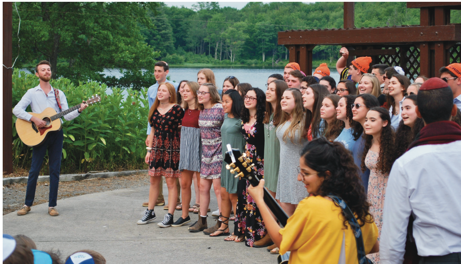
Ramah Poconos, 2019

I am who I am the rest of the year, in the rest of my life, because I learned how to “be” here at Camp Ramah. Why I’m still here? Because I’m an incomplete project and always will be. And as long as I’m learning how to be me, I feel the pull back to camp to keep trying, keep making mistakes, keep growing.