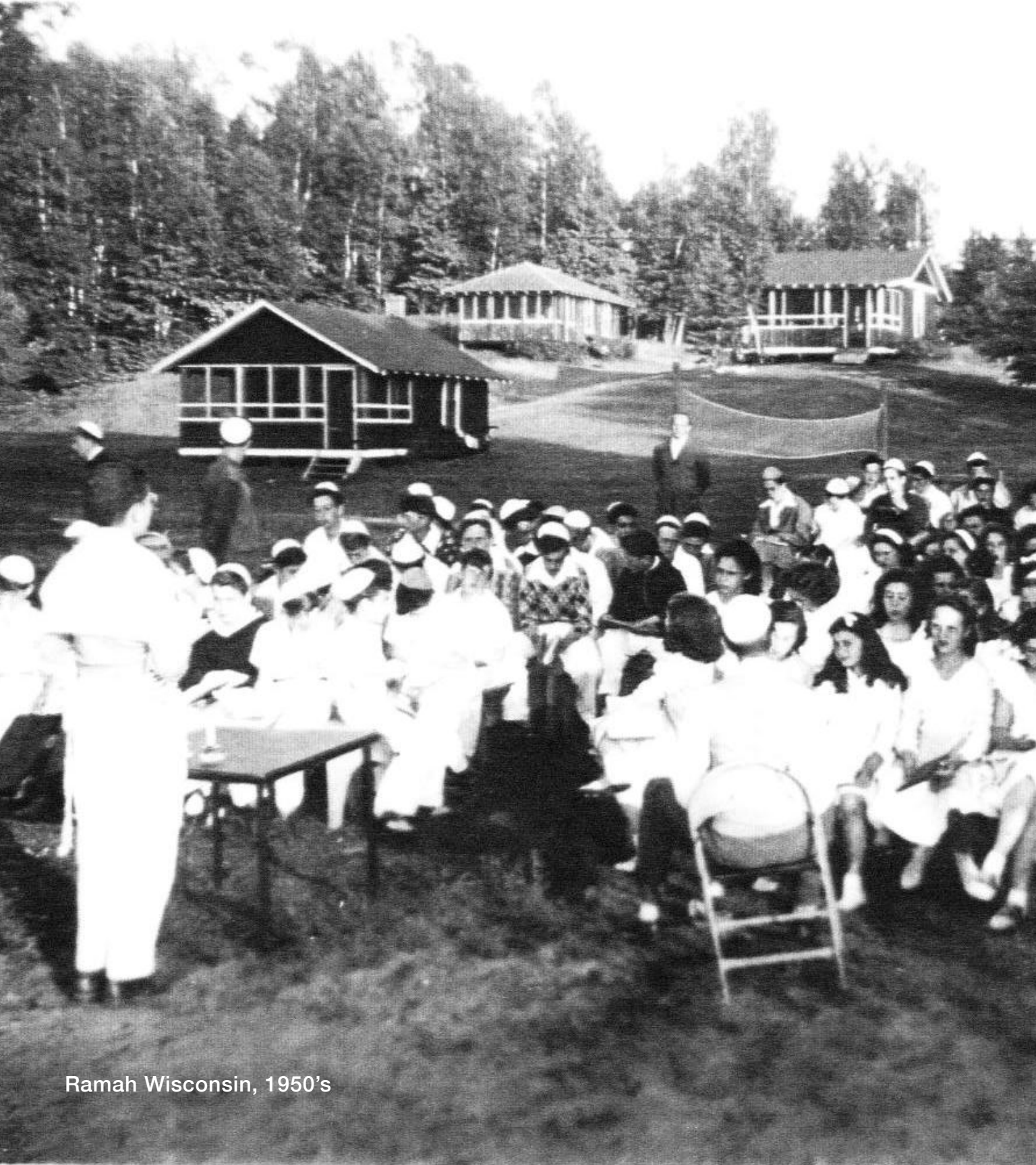
Ramah Wisconsin, 1950's

When I speak to a group of parents about Ramah, I talk about Ramah and not Camp Ramah.